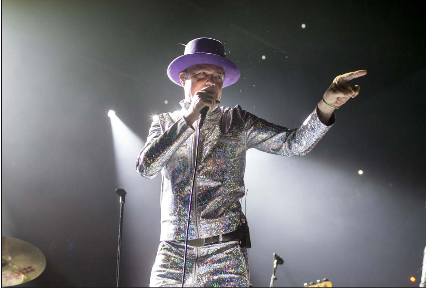
Gord Downie of The Tragically Hip performing at the Air Canada Centre in Toronto as part of the band's Man Machine Poem tour.